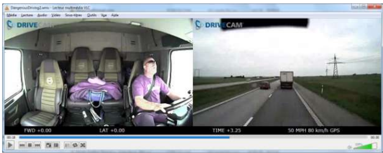
Figure 1: Note that noise has been added to the driver image due to integrity reasons.

Project within "FFI - Fordons- och trafiksäkerhet"