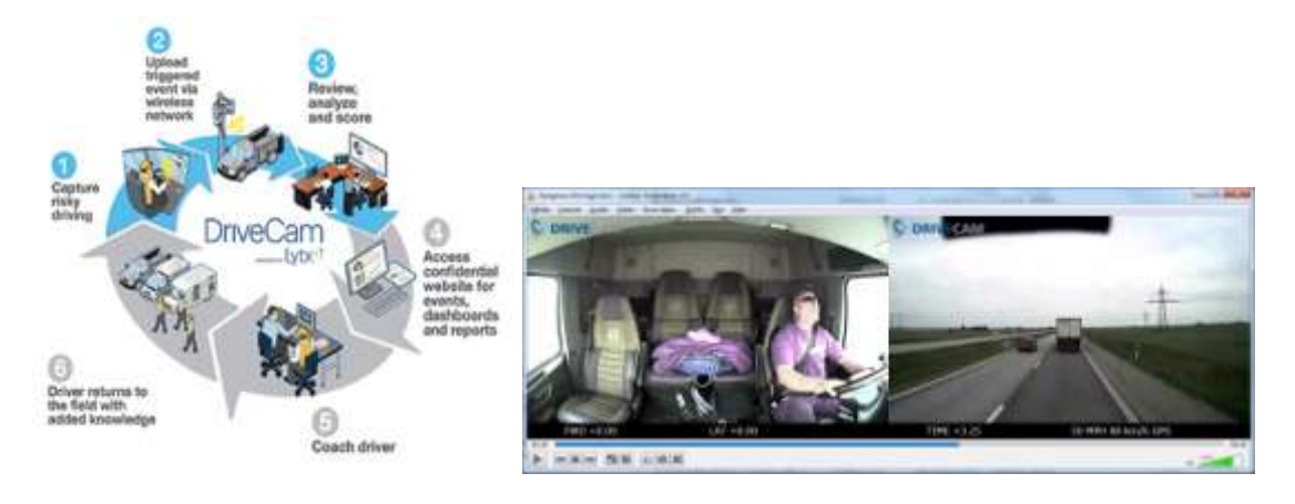
Figure 3: Overview of the drivecam program plus an Example of the video event recorder. Note that noise has been added to the driver image due to integrity reasons.

The DriveCam Program identifies why accidents happen using video event recorder to capture and correct risky driving habits, see image below. Two cameras are used, one looking forward on the road and a second one looking at the driver. The events are triggered by acceleration sensors in longitudinal and lateral directions. The current system does not use in-vehicle data and do not target specifically distraction.