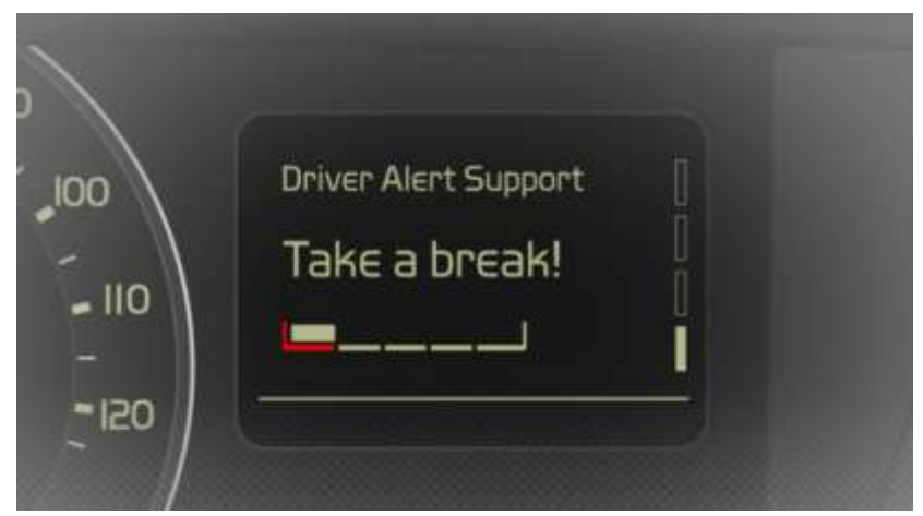
Figure 2: Driver Alert Support is an intelligent system that tracks your driving behaviour. If it differs from normal and indicates tiredness, you are alerted by a signal and a message in the display, advising you to take a break